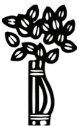
SGOT - Schweizerische Gesellschaft für Orthopädie und Traumatologie